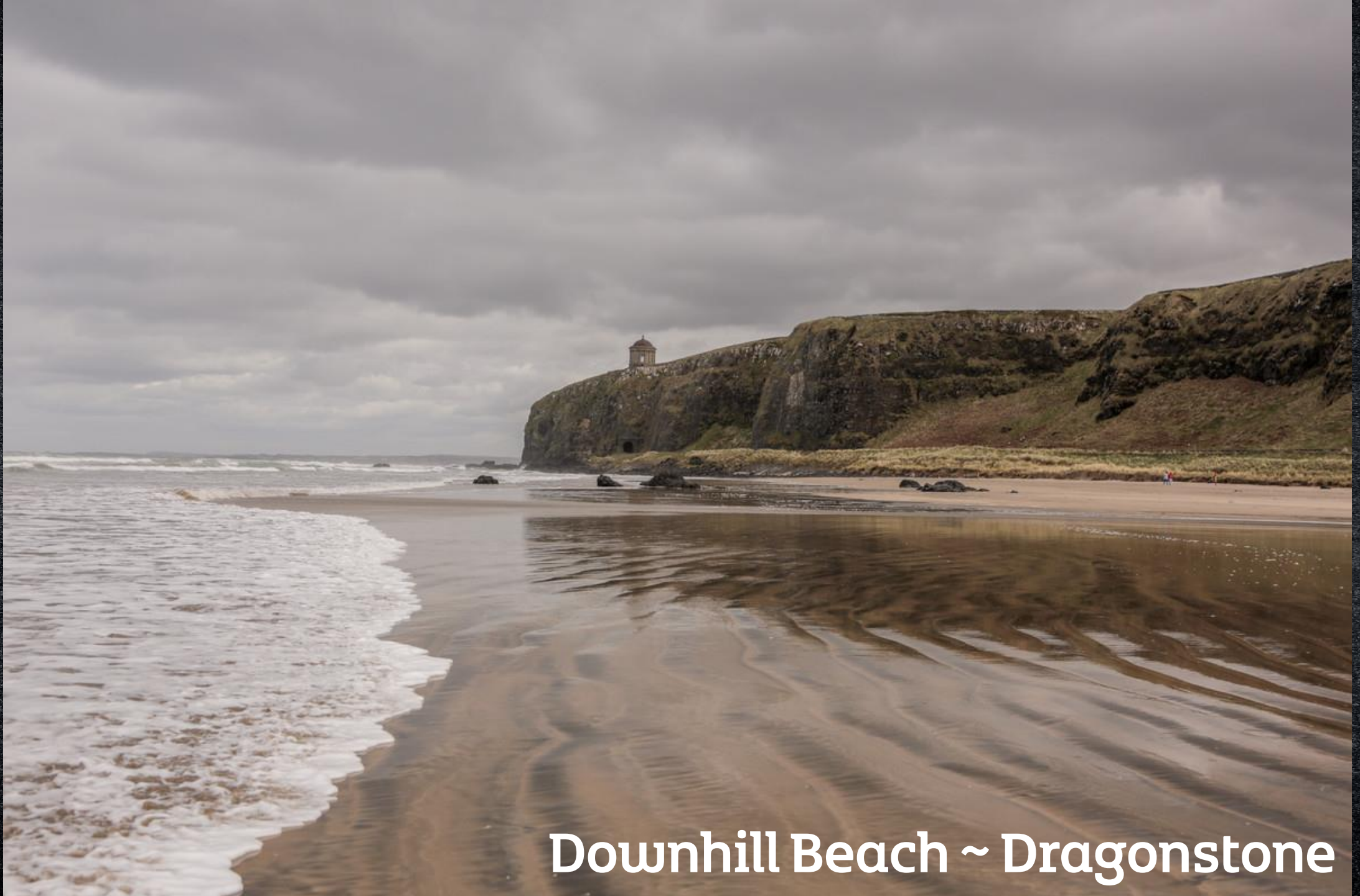
Downhill Beach ~ Dragonstone