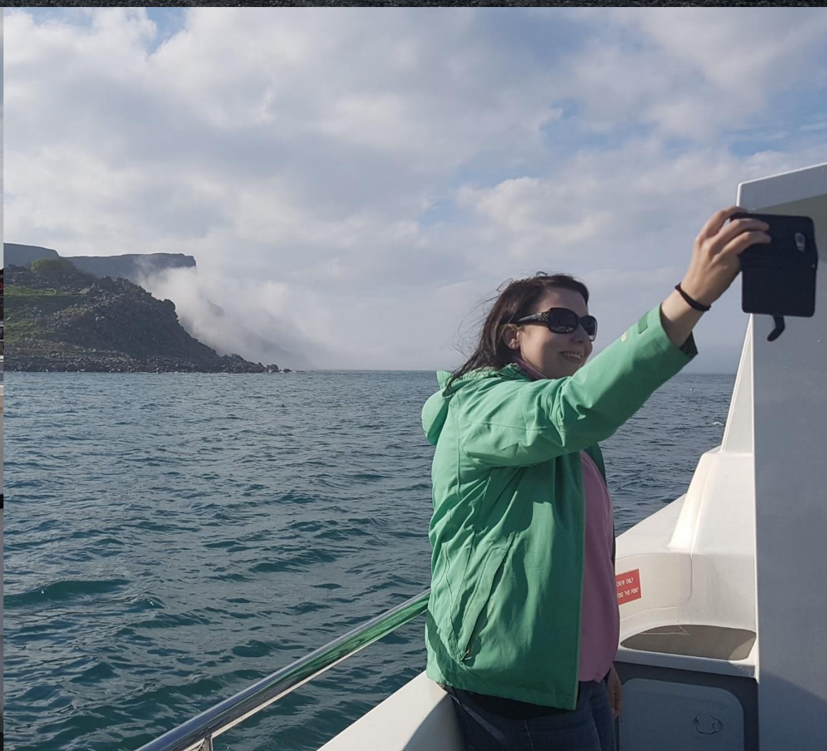
Filming Locations Tours by Boat