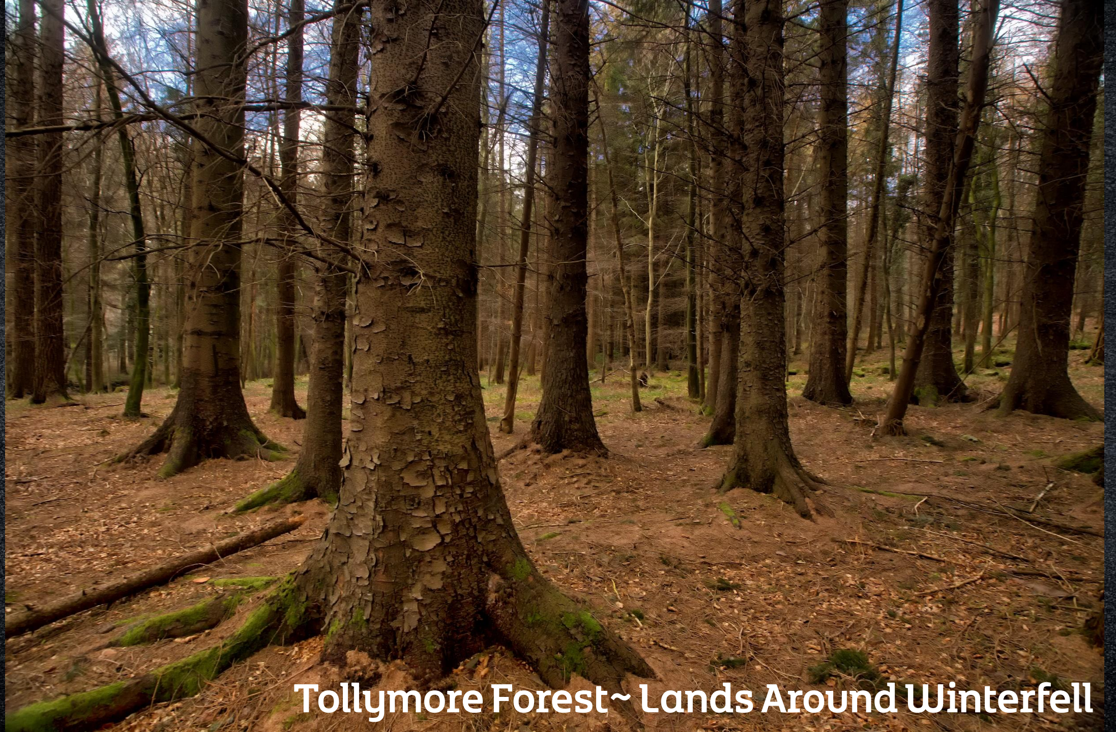
Tollymore Forest ~ Lands Around Winterfell