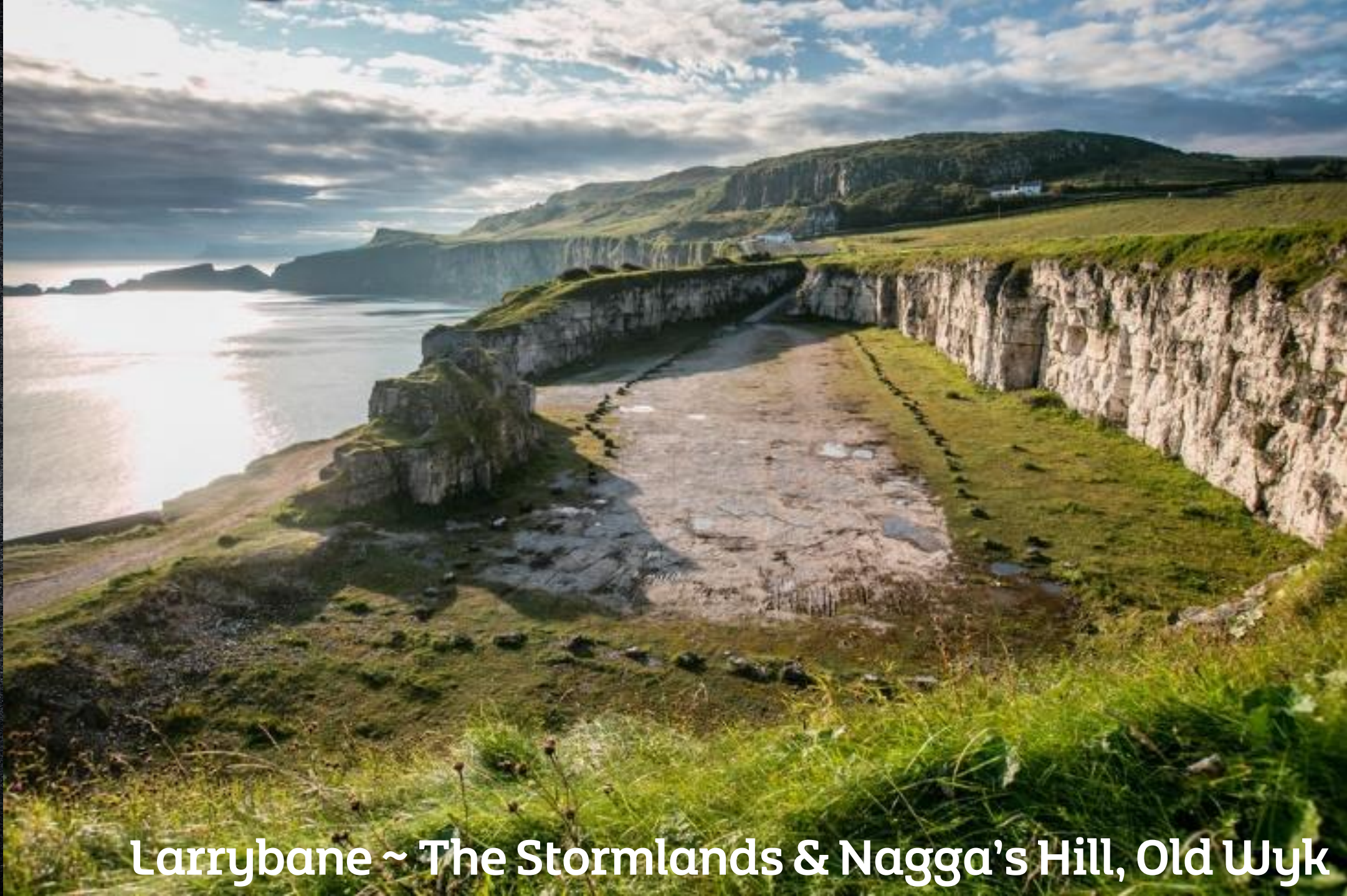
Larrybane ~ The Stormlands & Nagga's Hill, Old Wyk