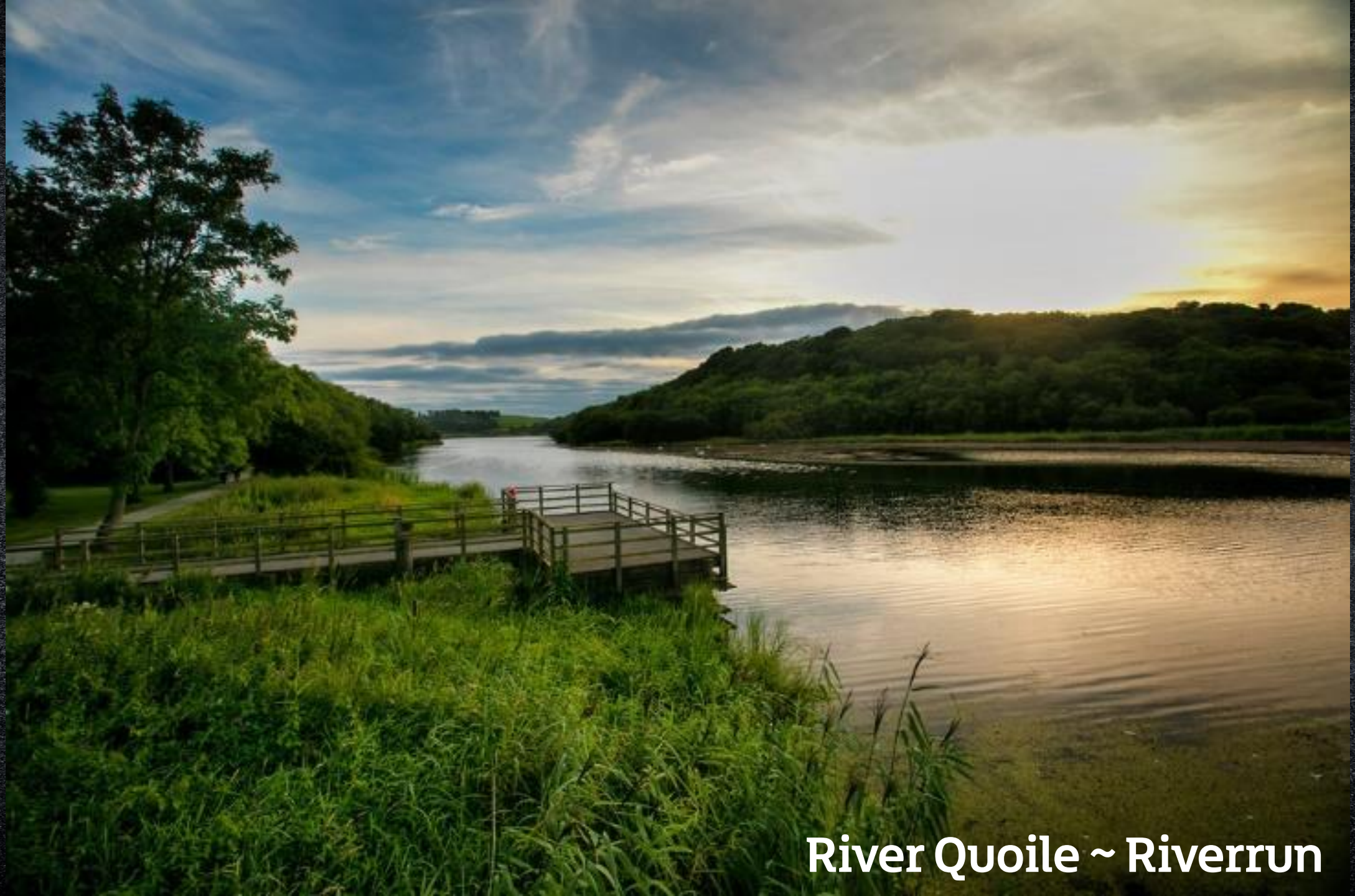
River Quoile ~ Riverrun