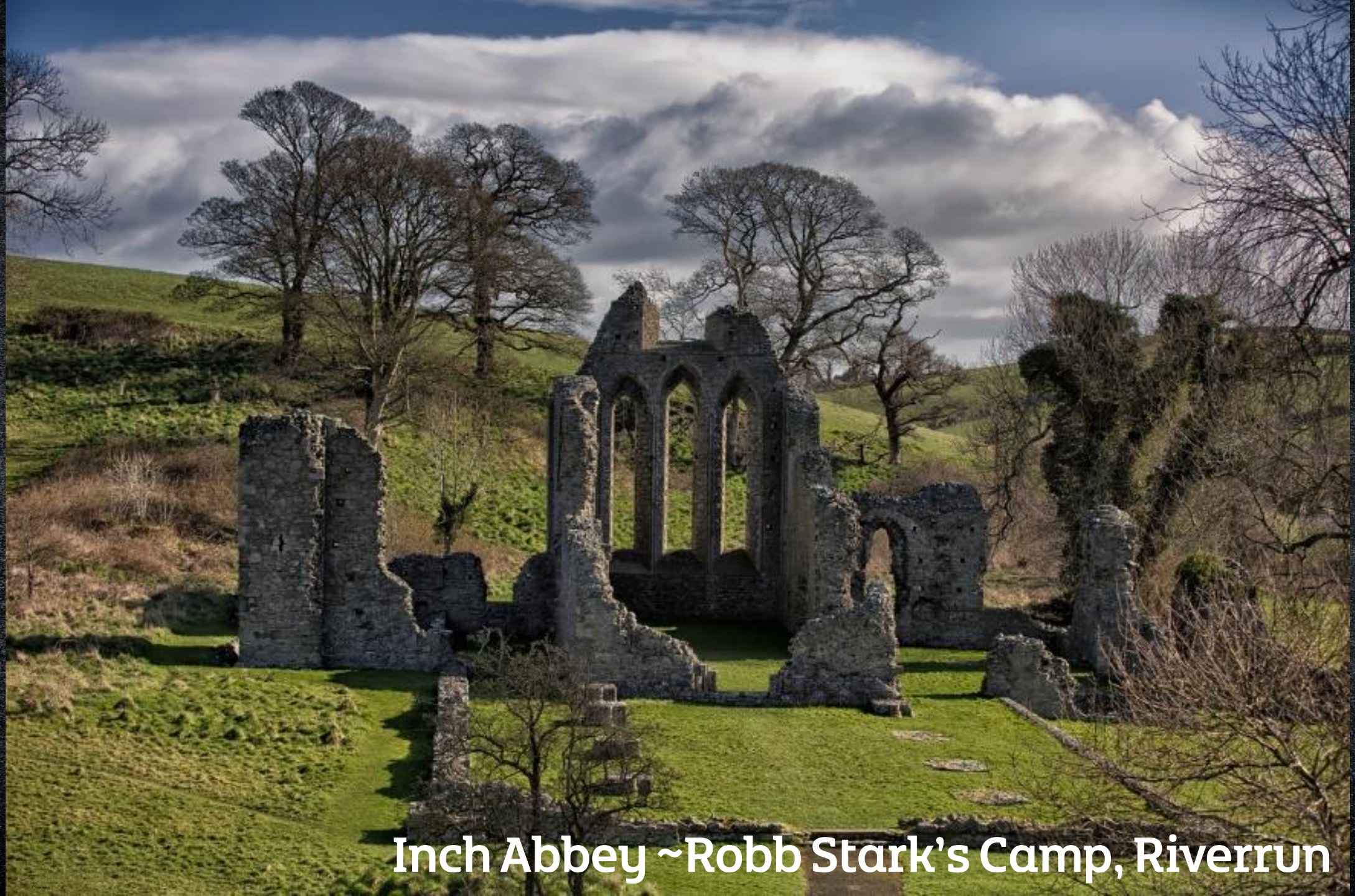
Inch Abbey ~Robb Stark's Camp, Riverrun