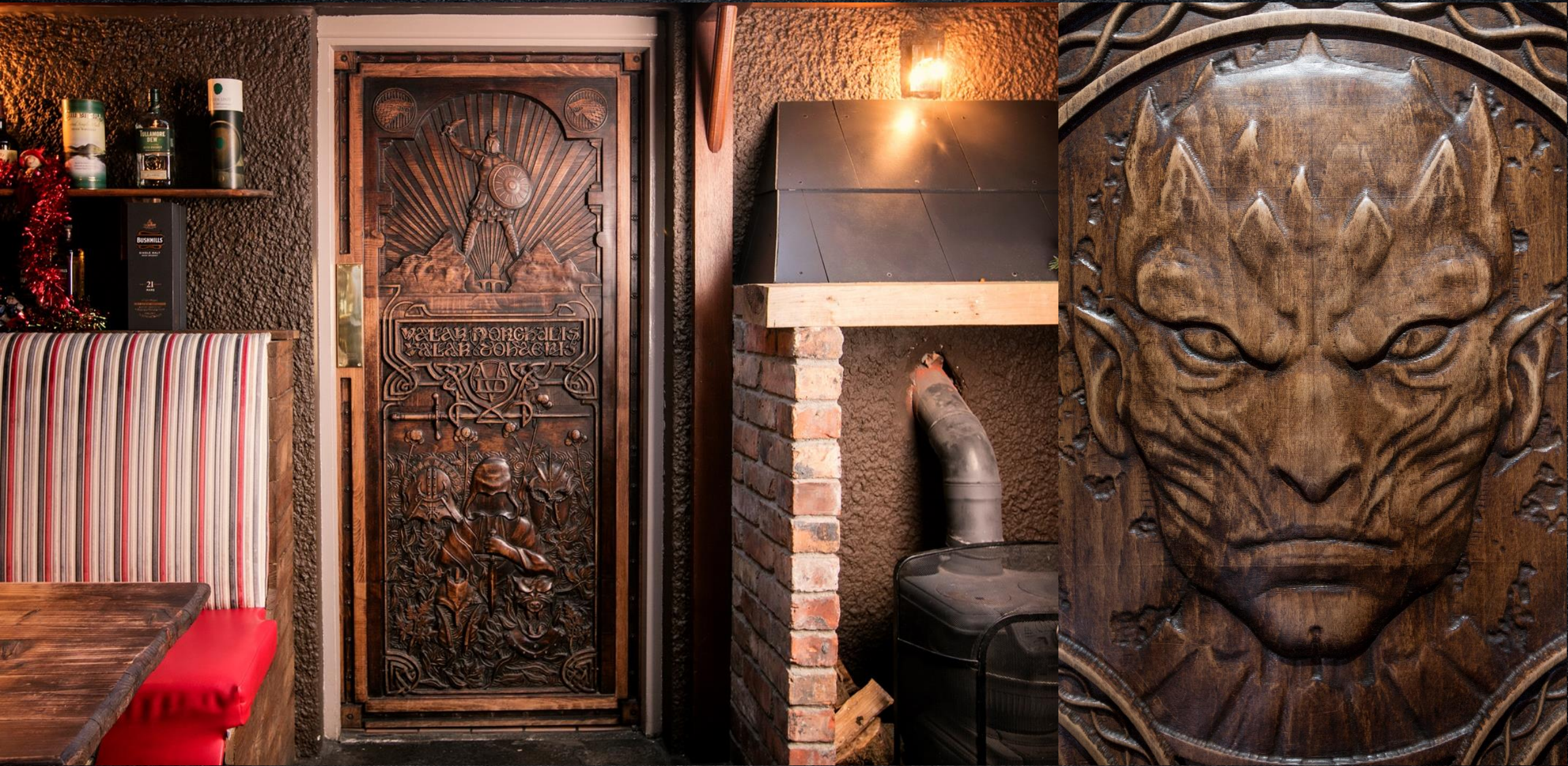
Doors of Thrones