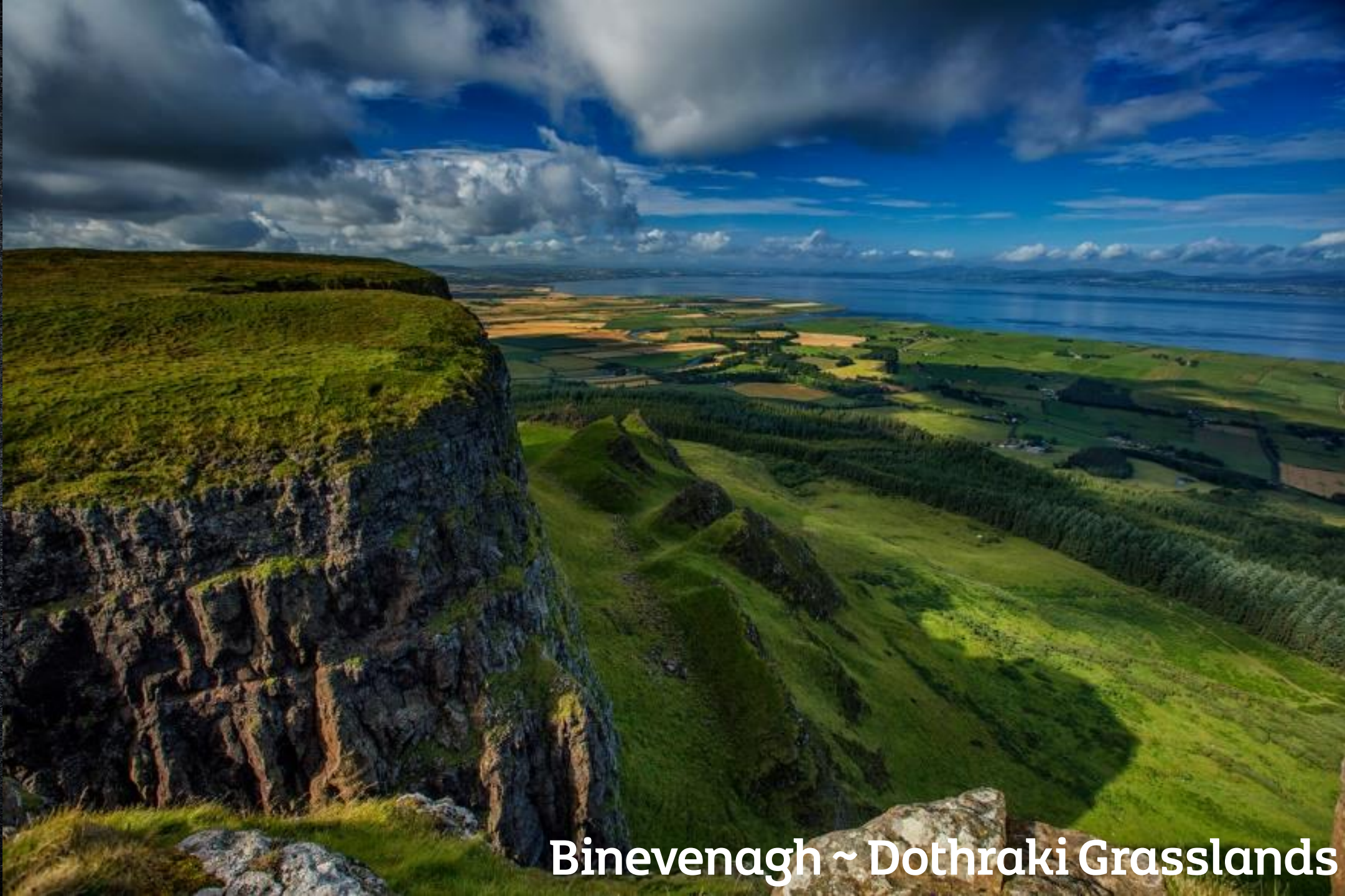
Binevenagh ~ Dothraki Grasslands