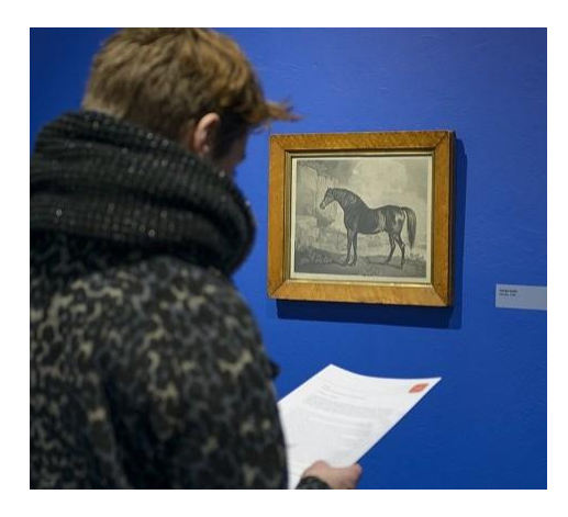
VOID DERRY Horse exhibition, 2015

This report repeatedly and unapologetically talks about distinctiveness. Northern Ireland has it, and by embracing its