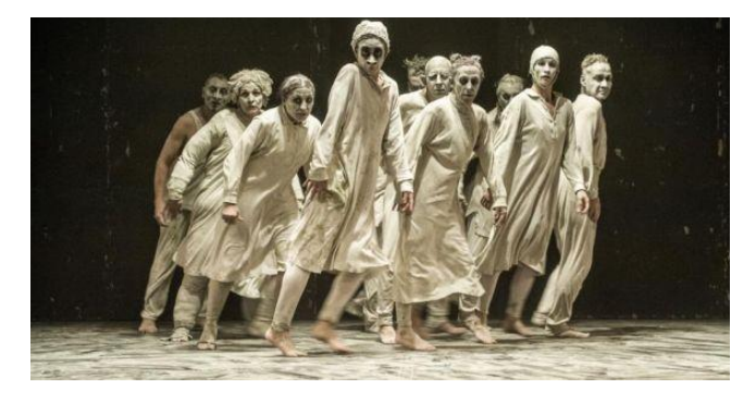
May B, Maguy Marin Dance Company, Happy Days Festival

In other words, connecting the dots for visitors in a way that makes sense, excites and can be easily accessed. By weaving the epic and the 'hidden gem' stories together through the undeniable heritage assets, Northern Ireland's narrative can stand apart as internationally distinctive but also personal – using the country's character and characters to project a vibrant, relevant, fresh and edgy heritage. This can only be achieved by embracing cultural programming alongside interpretation – the literary festival celebration of Samuel Beckett (www.happy-days-enniskillen.com) being a great case in point, which ran until 2015 and continues to inform cultural programming through leading producers like Séan Doran. As The Guardian put it: "a festival filled with good surprises". This is just one indicator of the strategic challenges in embedding consistent, reliable and long-term funding and investment in culture and heritage where it can makes a cultural and economic difference.