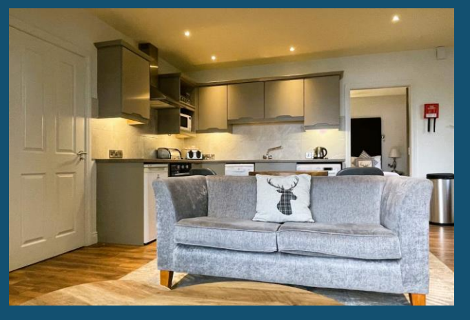
Lusty Beg, Kesh

4% of the available hotel rooms in NI are in Fermanagh & Omagh LGD.