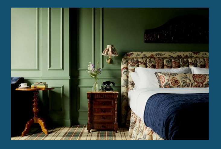
Slieve Donard Hotel, Newcastle

This LGD has 6% of the available hotel rooms in NI.