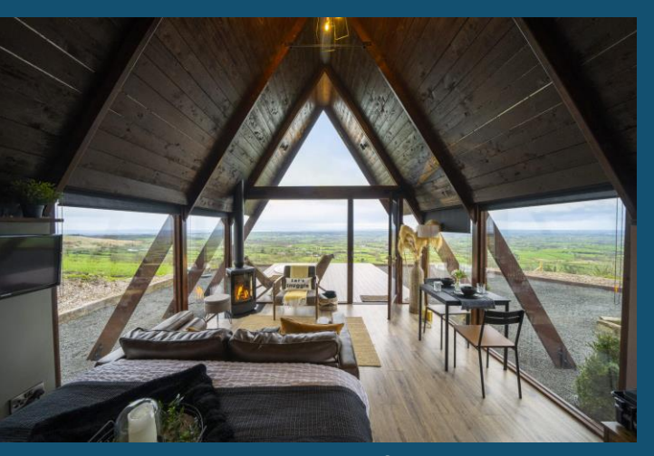
Letteran Lodges, Magherafelt

Mid Ulster LGD has 4% of the available GH/GA/B&B rooms in NI and 3% of the available self-catering rooms.