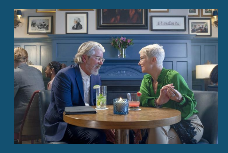
Bishop's Gate Hotel, Derry-Londonderry

Derry City & Strabane LGD has the second largest number of hotel rooms (after Belfast).