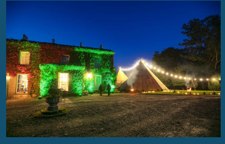
Crannagael House, Portadown

Armagh City, Banbridge & Craigavon LGD has the lowest number of hotel rooms and the third lowest number of self-catering rooms of all the LGDS.