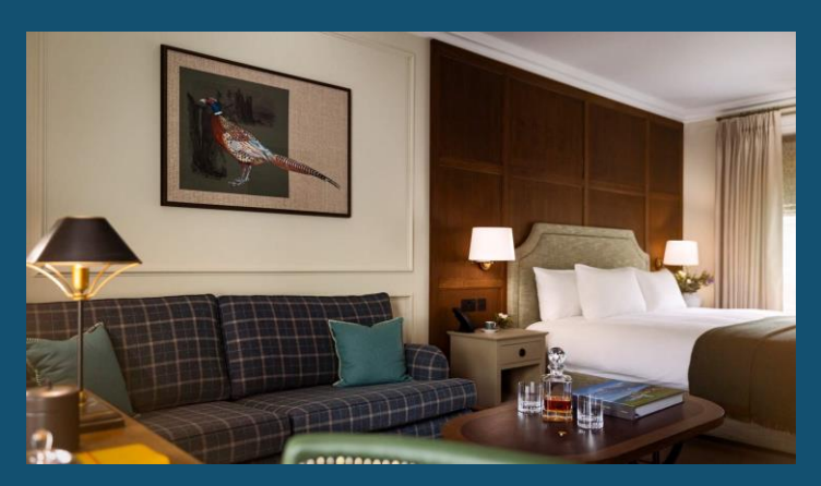
Dunluce Lodge, Portrush

Causeway Coast & Glens LGD has the largest number of GH/GA/BB rooms and the largest number of self-catering rooms of all the LGDs.