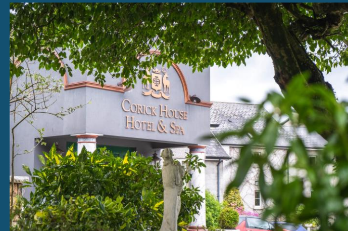
Corrick House Hotel & Spa