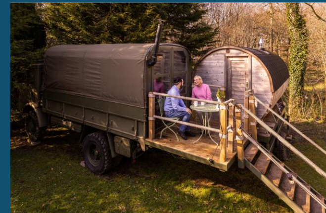
Larchfield Estate, Lisburn