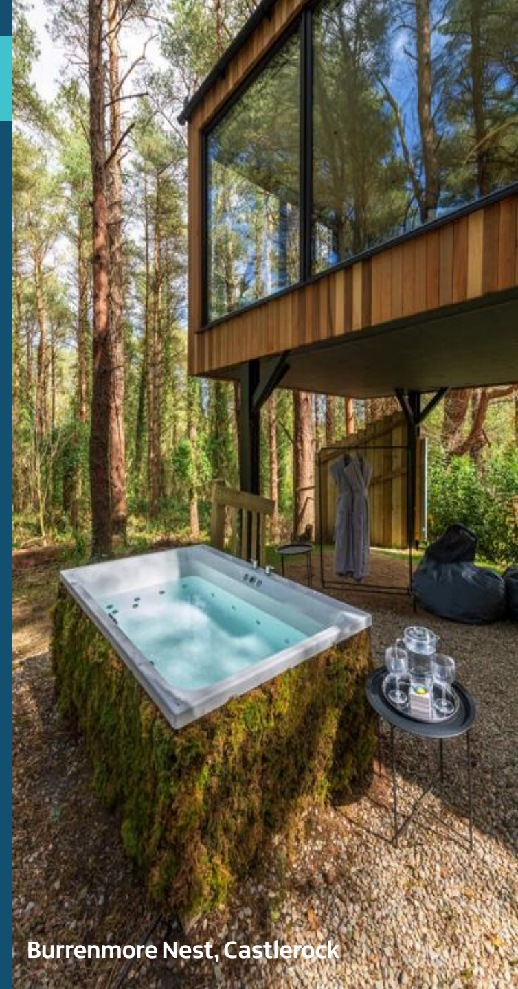
Burrenmore Nest, Castlerock

Figures exclude school, university and college stock which offer accommodation, totalling 9 premises with 4,145 rooms and 4,369 bed-spaces