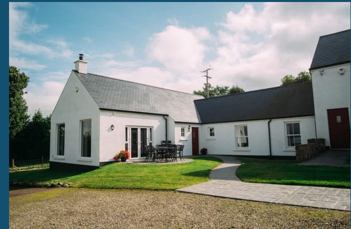
Finn Valley Cottages, Strabane