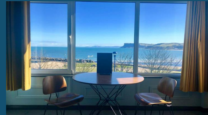
Marine Hotel, Ballycastle