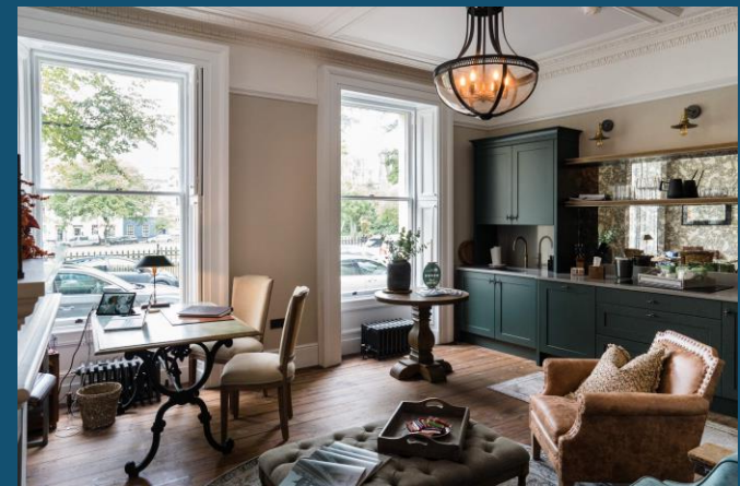
The Regency, Belfast