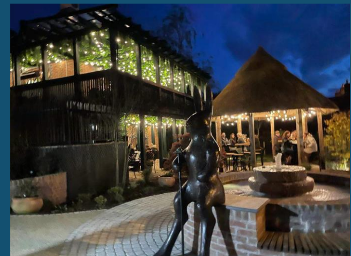
The Rabbit Hotel & Retreat