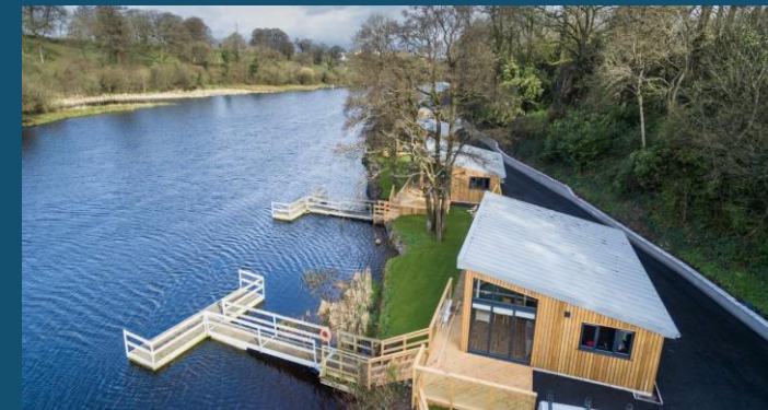
Killyhevlin Lakeside Lodges

4% of the available hotel rooms in NI are in Fermanagh & Omagh LGD