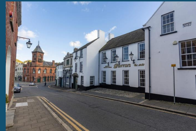
Denvir's Coaching Inn, Downpatrick

This LGD has 6% of the available hotel rooms in NI