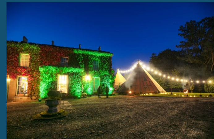
Crannagael House, Portadown