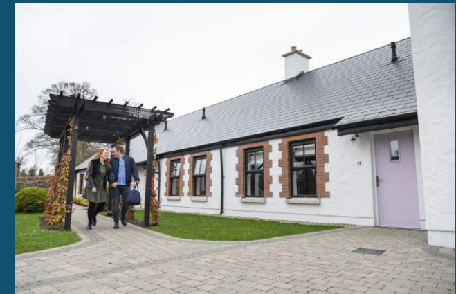
Galgorm Self-Catering Cottages

Mid & East Antrim has 6% of the available GH/GA/B&B rooms in NI and 4% of the available self-catering rooms